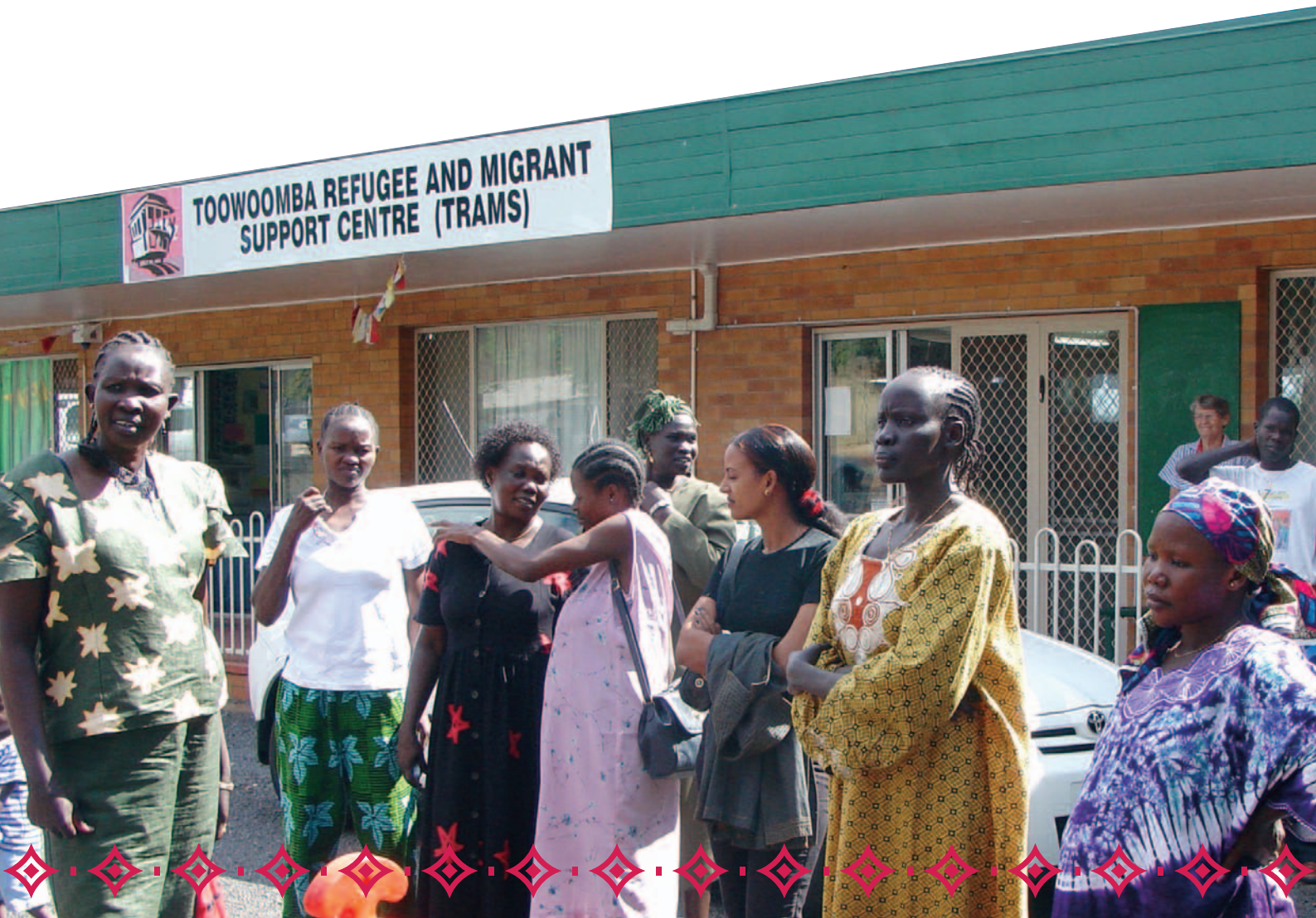
PLATE 3.4 FOCUS GROUP 3 – TRAMS

“If there is a fire in your house your biggest concern is the life of your kids”