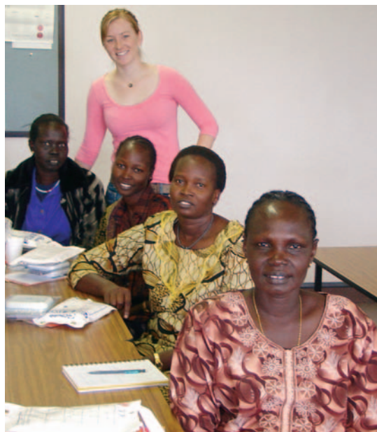
PLATE 3.2 FOCUS GROUP 1 – TAFE

This research project is not without limitations. The participants of this research varied in both number and diversity. Given the number of participants was fairly small and consisted of a larger proportion of females, the views expressed by participants cannot be assumed to represent those of the broader community. The responses given however are considered to have some validity given they belong to members of the Sudanese community.