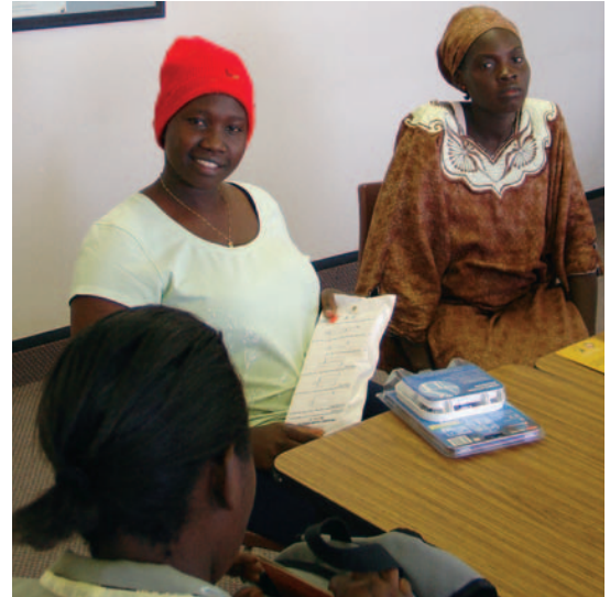
PLATE 3.3 FOCUS GROUP 2 – TAFE

Some participants had experienced bushfires in their homeland. People used a traditional method to extinguish the fire which involved beating the fire with sticks and leaves. The focus group findings indicate that in terms of fire in Africa, the focus is on response rather than prevention.