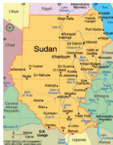
Figure 2.1 The Country of Sudan

The ongoing conflict between Islamist government forces and the Sudan People's Liberation Army (SPLA) and other armed opposition groups has hindered Sudan's economic and political development and has resulted in countless human rights abuses by all parties, including executions, torture, abductions, sexual violence, forcible recruitment of child soldiers and slavery (Deng, 2001). More than two million people have died as a result of war and related causes. Approximately five million people have been displaced, while half a million have fled across an international border (Deng, 2001).