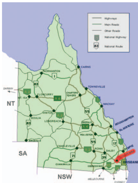
Figure 3.1 City of Toowoomba (Wikipedia, 2006)

The city of Toowoomba is located 132km west of Queensland’s capital city, Brisbane, and two hours drive from the Gold Coast and Sunshine Coast beaches (Figure 3.1). In 2003, the city’s population was estimated at 113,687 making Toowoomba Australia’s second largest inland city after Canberra, the nation’s capital (Wikipedia, 2006). Given the large concentration of Sudanese located in Toowoomba, the city became the ideal site for QFRS to conduct this research.